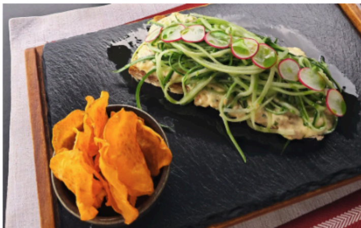
Breakfast at Grand Forest Metsovo is a colourful spread of hot and cold dishes

The main restaurant, Metsovo 1350m, has dishes that really showcase the region's fresh produce – think wild mushroom ragout, renowned Metsovo cheeses and marinated trout from the Aaos river. The setting, with its sweeping views, is the icing on the cake. Wines include the excellent Traminer by Averoff Estates in nearby Metsovo.