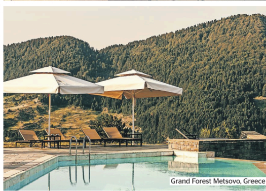
Grand Forest Metsovo, Greece

barefoot trail, feeling the sensations of pine needles, leaves and stones underfoot. Details B&B doubles from £148 a night, minimum two-night stay (thevagar.pt). Fly to Viseu or Porto