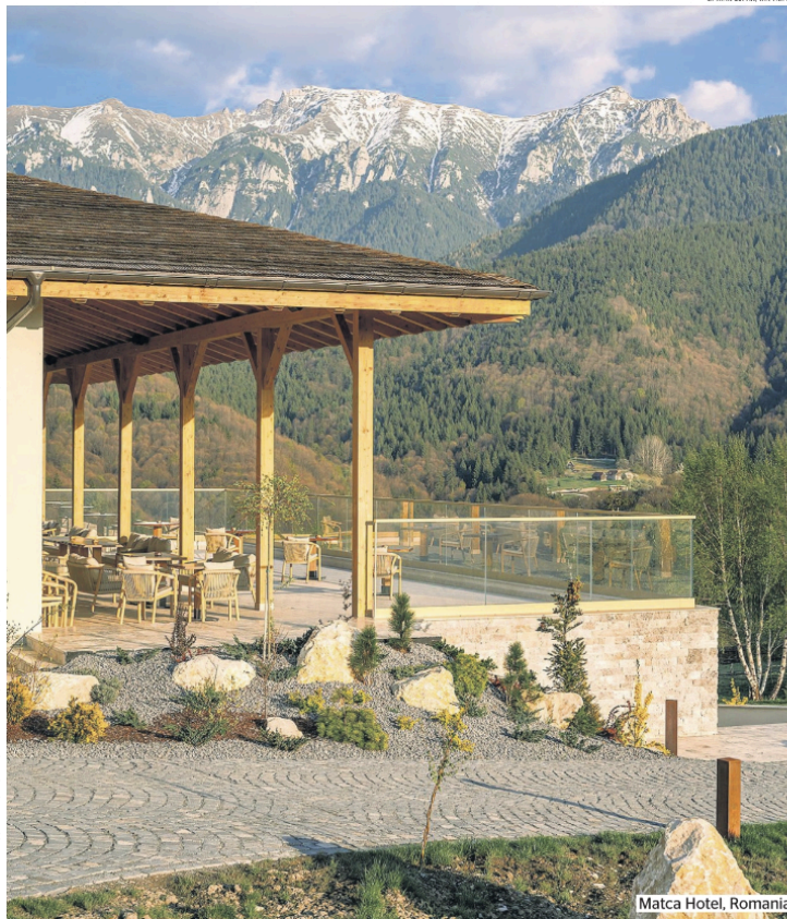
Matca Hotel, Romania

Julian Alps, Slovenia Slovenia isn't lacking in winsome hotels with windows opening onto pine-fringed wonderlands. Whittling down a choice, however, can feel like picking a pine needle from a well-plumped haystack. Which is where Triangel comes in. Close to Kranjska Gora in the Julian Alps, this small, crowd-pleasing hotel has windows that look out on the mighty peaks of the Martuljek mountains in Triglav National