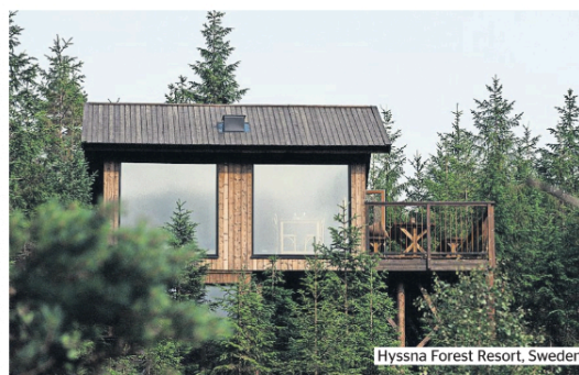
Hyssna Forest Resort, Sweden

Bridging the territory between cabin stay and hotel, this forest of 50-odd cabin suites an hour's drive south of Liège, in the Ardennes, has all the earthy escapism you want from a back-to-nature stay but enough hotel-style trappings that you don't have to go the full Thoreau. Squirrel yourself away in a cabin for a couple of nights, emerging only to blink at the autumn sun as you hike the forested trails of the Two Ourthes Natural Park, or make the most of the services on site, ordering add-on breakfast and apéro baskets, or wild boar stew and wild berry bavares (€37pp for three courses) brought to the door.