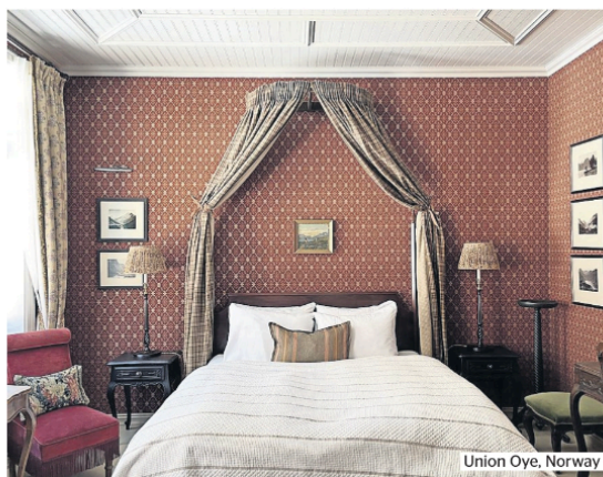
Union Oye, Norway

Transylvania, Romania Part luxury hotel, part cultural celebration, Matca opened last year in Transylvania, its low-pitched shingle roofs and inner courtyards inspired by the collections of the Astra Museum in Sibiu. The heritage theme continues in the 16 guest rooms and seven villas. Among such modern frills as walk-in showers and wi-fi are ceramics commissioned from local potters and coffee table books on Romanian wildlife (the hotel also has a private observatory where it's possible to spot bears). There's a spa, a pool and a restaurant serving pork tenderloin with mustard sauce, and delicate honey cake with blueberry jam (mains from £15). If the views of the Transylvanian Forest, and the Bucegi and Piatra Craiului mountains aren't hauntingly beautiful enough for you, you're 20 minutes' drive from the infamous Bran Castle (entry £15, bran-castle.com). Details B&B doubles from £395 (matcahotel.com). Fly to Brasov