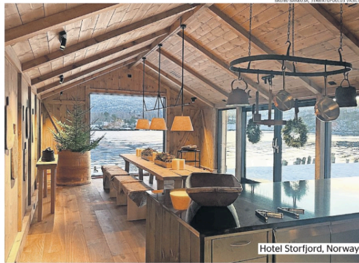
Hotel Storfjord, Norway