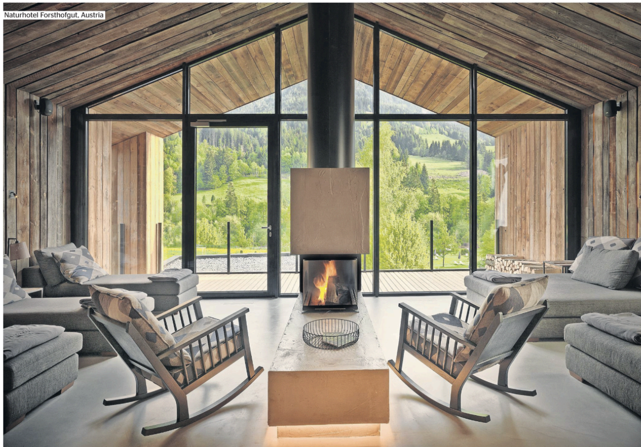
Naturhotel Forsthofgut, Austria